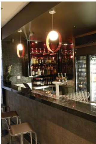
ER 3 (Bar view)