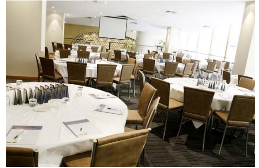
Events Room 1 (ER 1)

CQ functions has spaces to suit 60 to 1200 for functions, dinners, conferences, training, team building, exhibitions, cocktail parties, or practically any event. CQ will coordinate post-function drinks at one of our bars, or accommodation in our 71 room Citiclub Hotel, which is situated on the upper floors of the CQ complex.