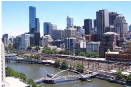
Balcony West view