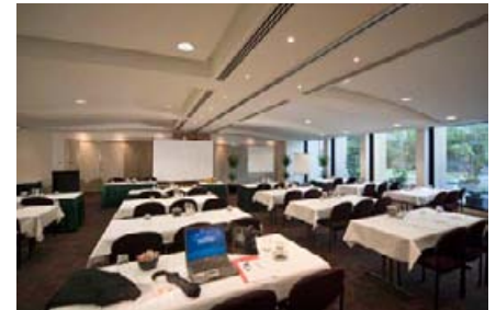
Southbank I & II Events Suite