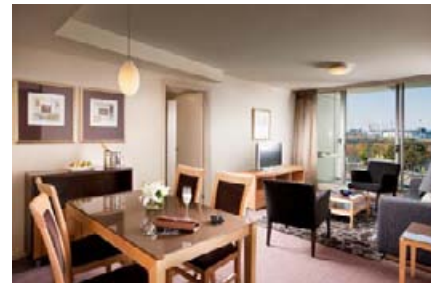
2 Bedroom Suite living area