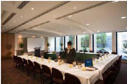
Southbank II Events Suite