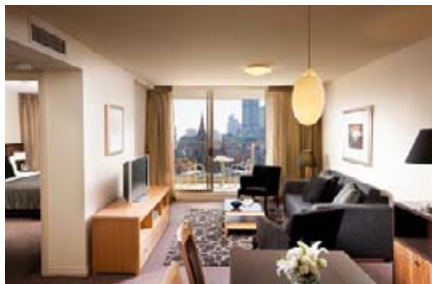
Premium 1 Bedroom Suite living area