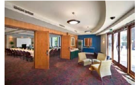
Meeting Room Foyer