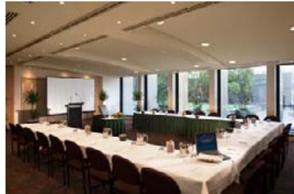
Southbank II Events Suite