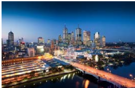
Melbourne City view

welcome | services & facilities | day packages | breaks | breakfast | lunch & dinner | cocktail | beverages | gallery