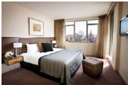
Premium 1 Bedroom Suite