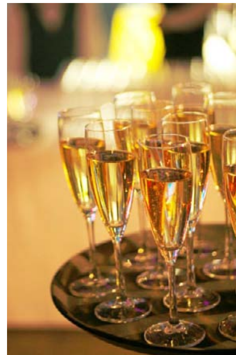
Our hotel practices responsible service of alcohol.

Please note that beverages may also be charged on a consumption basis.