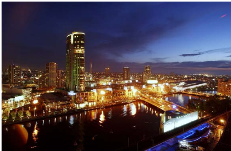
Night view from Crown View Room– Level 19

$60.00 Per Person Per Day (Minimum 10 Delegates)