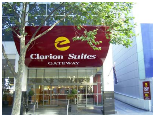
Hotel Entry on William Street