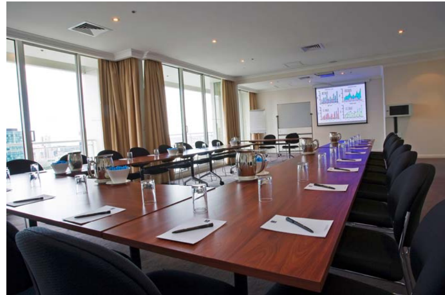
Yarra View Room– Level 17

(Additional A/V prices available upon request)